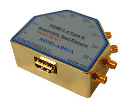
Fig 1: HDMI Type A receptacle test fixture(HDMI-AR01A)

LiTek's HDMI-AR01A is a HDMI Type A receptacle test fixture used to measure HDMI cable with Type A plugs and HDMI source with HDMI Type A receptacle connector and connected with HDMI A type cable assembly. There are 5 pairs with SMA connectors in the Scope or Signal generator sides. The impedance in the test fixture is well designed between 95~105 ohms. The intra pair skew for all 5 pairs are designed less than 3ps.