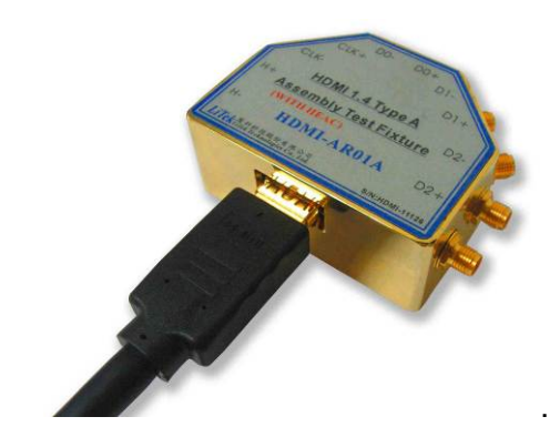
Fig 2: HDMI-AR01A, plugged with a HDMI Type A plug cable

LiTek's HDMI-AR01A is a HDMI Type A receptacle test fixture used to measure HDMI cable with Type A plugs and HDMI source with HDMI Type A receptacle connector and connected with HDMI A type cable assembly. There are 5 pairs with SMA connectors in the Scope or Signal generator sides. The impedance in the test fixture is well designed between 95~105 ohms. The intra pair skew for all 5 pairs are designed less than 3ps.